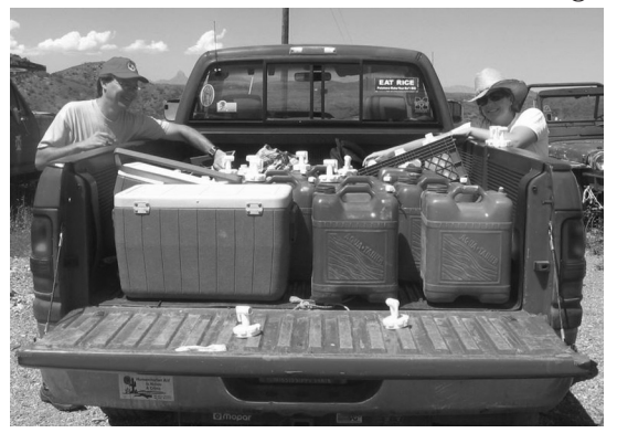
Two volunteers on a water run - jugs must be filled and brought to the camps weekly.

Check our web site for most current needs - www.nomoredeaths.org or write to donations@nomoredeaths.org